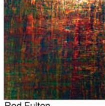
Rod Fulton Striations Series-Untitled $350