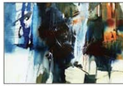
Mel Grunau Tropia $795