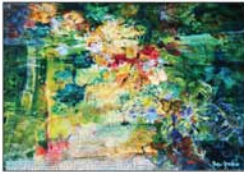
Nancy Page Graeber Green Awakening $1,800