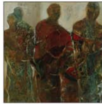
Jim Carpenter Antiqui $3,000