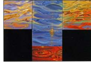
Gregory Simmons Liquid Kimono $2,500