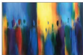
Leo Posillico Garden View $2,800