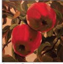
Angela Bandurka Washington Harvest $1,750