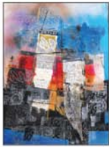
Patricia Cairns Tower of Babel $1,200