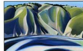
Nancy Yaki Lake Cachuma, Noon $2,400