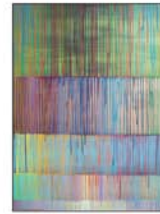
Marilyn Dizikes Shades of Twilight $1,200