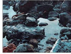
Tom Gould Tide Pool NFS