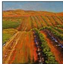
Trice Tolle Rows Upon Rows $1,800