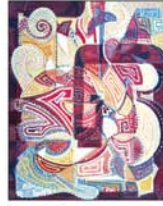
Elise Beattie Navigating Life $800