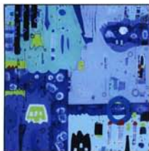
Anri Tsutsumi Peppermint Fantasia NFS