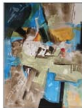
Isabella Pizzano High Tension $1,200