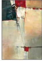
Carol Frye Thanks For All The Fish $1,050