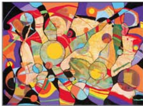
Jan Filarski Finally $1,200