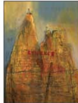
Hatsuko Higuchi Supression of Evidence $5,000