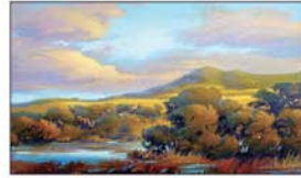
Kerne Erickson After the Rain $2,500