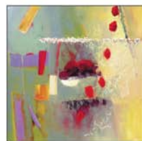
Barbara Krupp Glittering Fringe $1,200