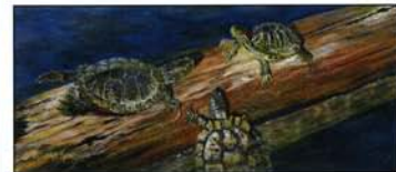
Cindy Sorley-Keichinger Turtle Talk $895