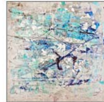
Kimberly Pratt Speed $1,200