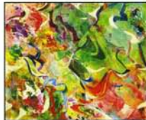
Ed Smiley Land of the Space of Today $700