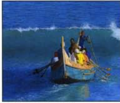
Rency Punnoose The Power of Harmony $1,000