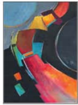
Laure Carlisle Opposing Forces $1,200