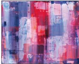
Charles Pifer Distant Voices $2,400