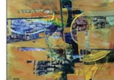
Lisa Fertig Abstract #541 $925