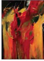
Denise Athanas Explosion of Color II $3,800