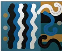
Rich Moyers Coalescing Diffidence $2,650