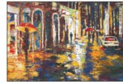
Cheryl Montanari Nightly Stroll $900