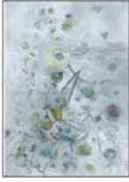
Christine Alfery Puzzle $2,200