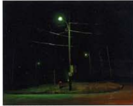
Jason Sacran Green Glow II $2,400