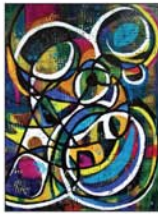
CC Burnett Chaos Theory $1,100