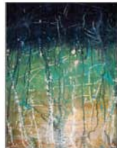
Sue Marrasso In Too Deep 2 $600