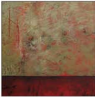
Nancy Eckels Barely Restrained $2,500