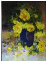
Diane Stolz Spring Dividend $1,400