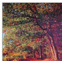
Greg Navratil Bright and Early $3,600