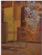
Ara Leites Leaving Now $3,000