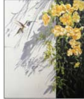
Reenie Kennedy Flutterby $1,100