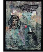
Lynne Hardwick Amazon Memories $1,500