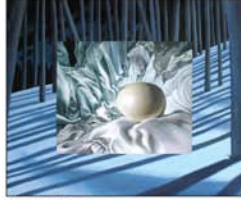
WB Eckert Winter Scene $4,500