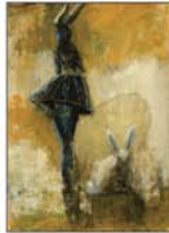
Cathy Hegman Rabbit Tricks II $3,600