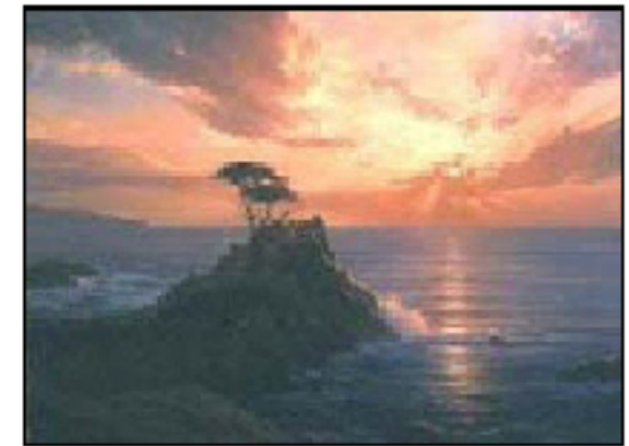
"The Tree at the End of the World" 16x22 Acrylic