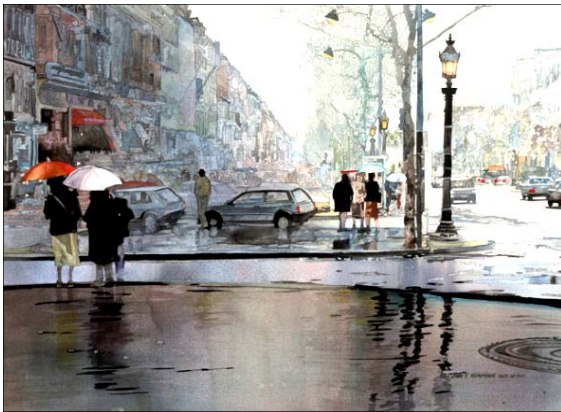
La Pluie en Avril Paris 22x30