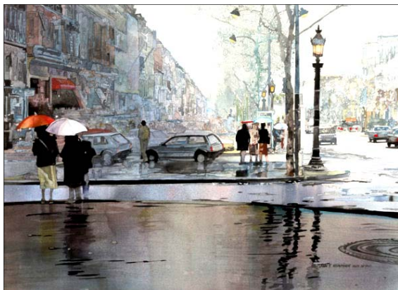
La Pluie en Avril Paris 22x30