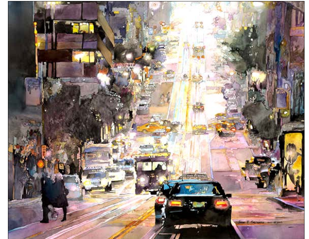
Winter Light 33x36