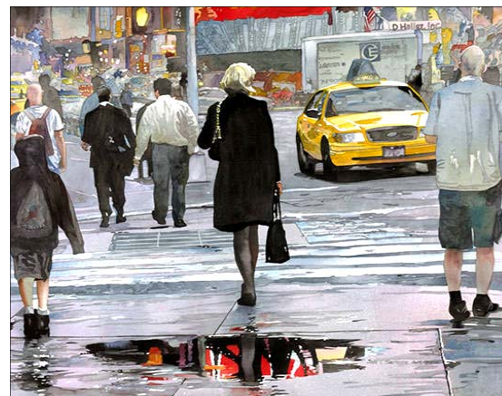
Midtown April 22x30