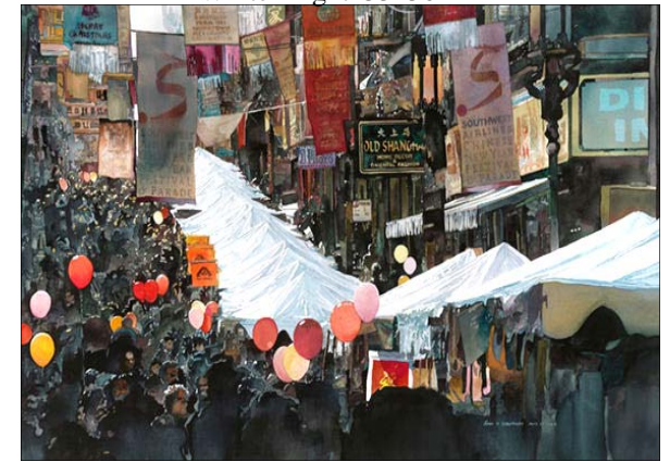
Grant Ave. San Francisco 25x35