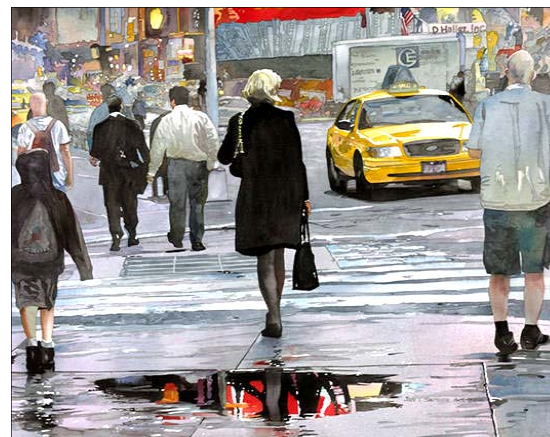
Midtown April 22x30