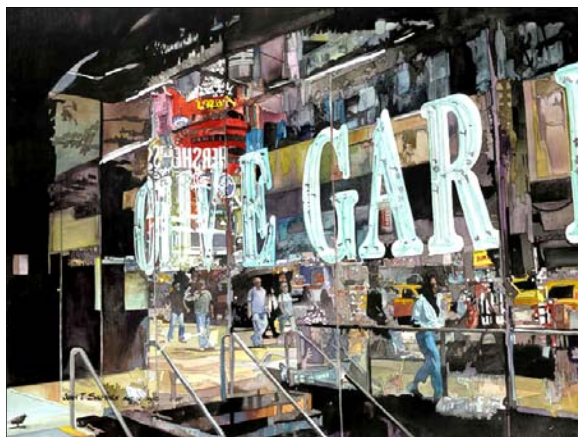
Olive Garden 22x30