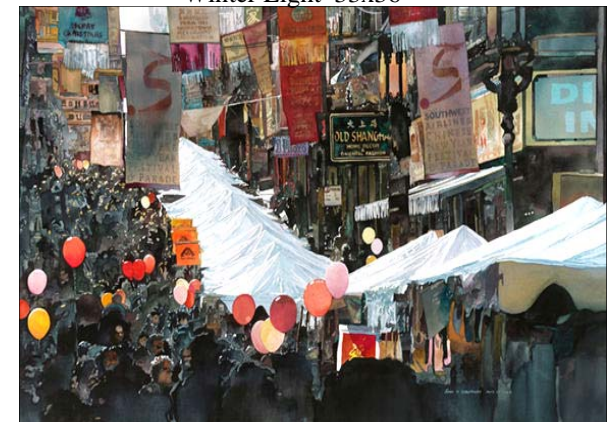
Grant Ave. San Francisco 25x35