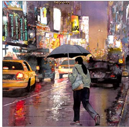
Times Square Umbrella II 22x24