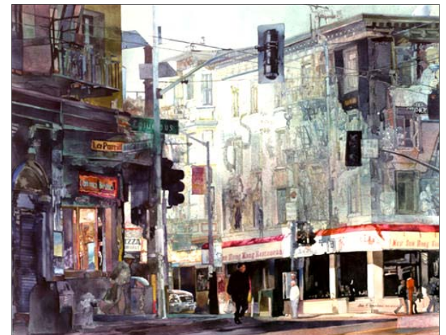
North Beach San Francisco 32x37