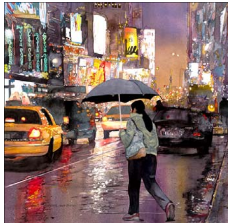
Times Square Umbrella II 22x24