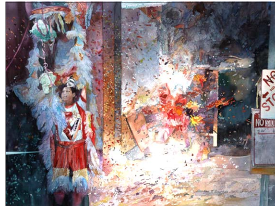
Lion Dancer 22x30