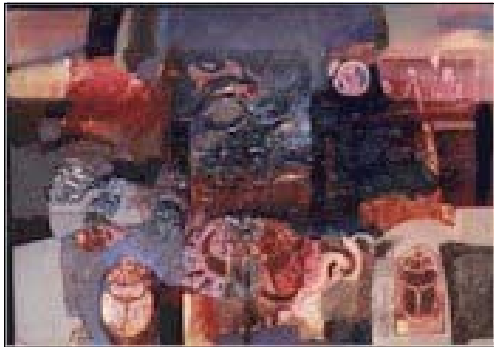
Ancient Memory, Acrylic on Crescent Board