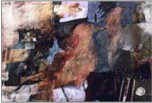
A Song Remembered, 28x48 Acrylic on Canvas