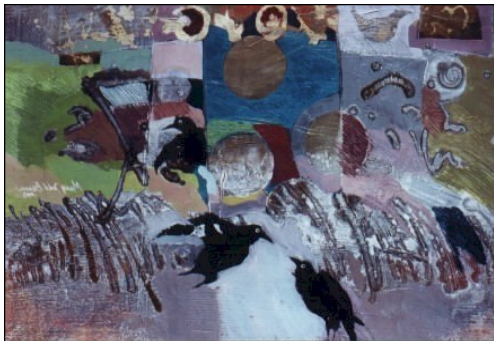
The First Morning, 30x40 Acrylic on Crescent Board