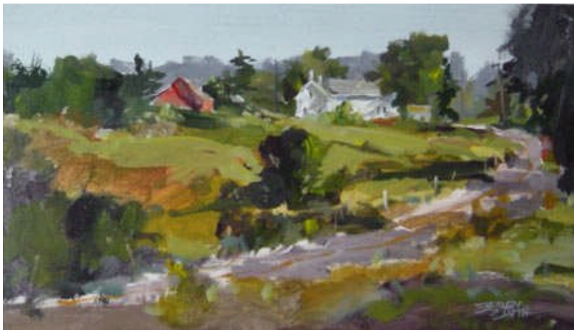
SMITH, Jerry, Black Horse Fine Art Supply: $500 in Merchandise