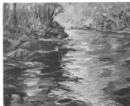
Sweet Bed of Creek