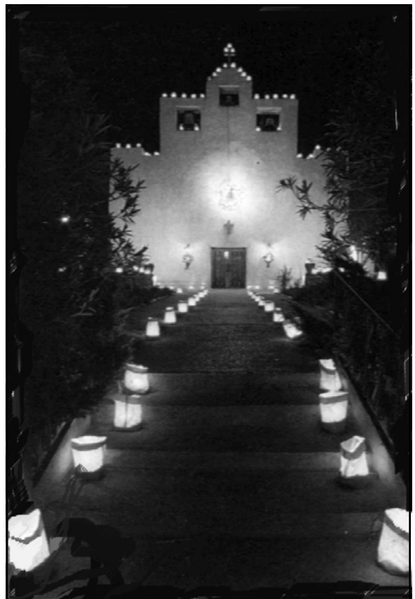
St. Francis de Paula Mission, Tularosa